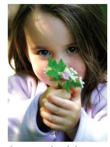
An easy way to keep the hope.

Interested? Visit our online giving page at ccmaine.org/give